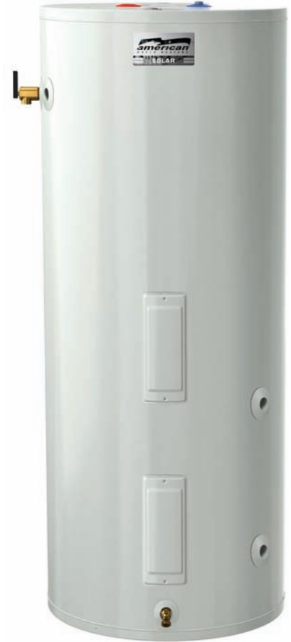
SSX62-80H-045S and SSX62-119H-045S