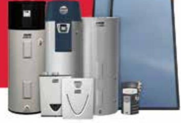
FREEDOM GOLD —BEST—