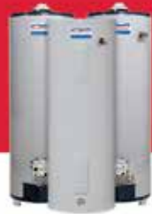
FREEDOM BRONZE —GOOD—