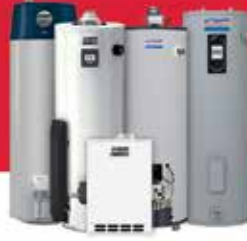
FREEDOM SILVER —BETTER—